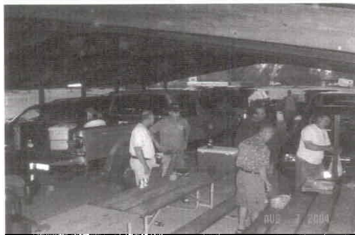
Vehicles under the picnic shelter? This was the August outing we won't forget!