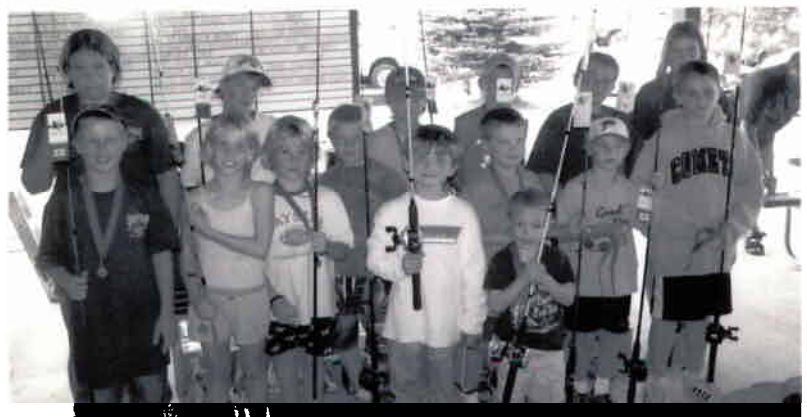
The 15 entrants in the Fish On Kid/Pass It On Division for kids 12 & under